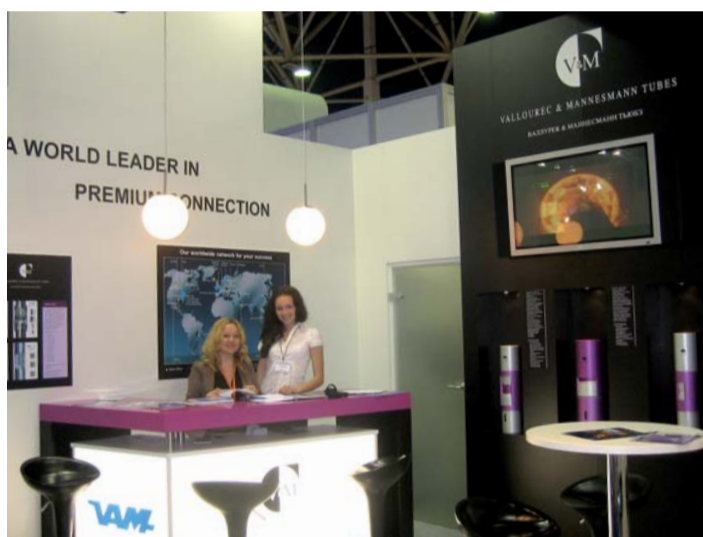
The MIOGE Conference in Moscow