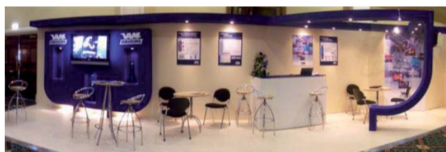
The IADC World Drilling Conference in Dublin