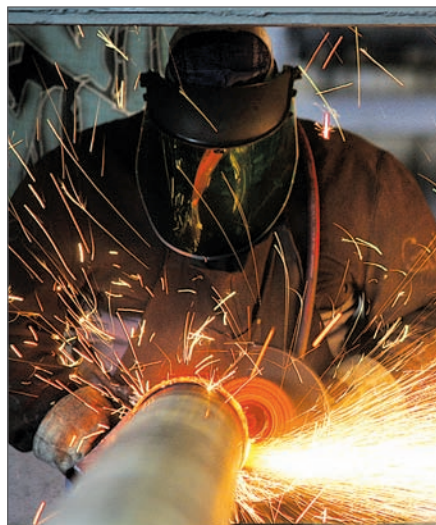
Drillstring tensile strength and torque capacity are major parameters that determine operator ability to drill extended-reach and ultra-extended-reach wells.

These technologies – composite drill pipe, aluminum drill pipe (Al DP) and titanium drill pipe (Ti DP) – all have their pros and cons.