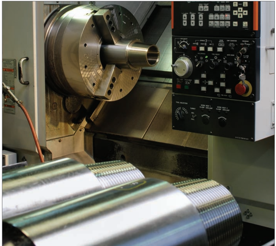
Fewer turns and easy make-up increases the service life of connections. Enhanced clearance between the box counter bore and pin nose also limits the stabbing risk.

Hydroclean drill pipe and heavy-weight drill pipe is a new-generation hole-cleaning and torque management tool that provides that “mechanical” boost. Integrally machined on full-length joints, Hydroclean upsets have specially designed grooves or blades. In these bladed sections, the combination of rotational speed, flow rate and the specially designed angles produce a num-